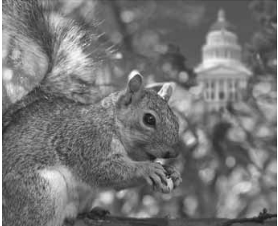
Capitol Park in Sacramento is popular with squirrels as well as legislators, lobbyists and locally elected officials.

Special session urgency bills require a two-thirds vote for passage. If signed by the governor, such bills go into effect immediately upon signature. Non-urgency special session bills, which require a majority vote for passage, go into effect on